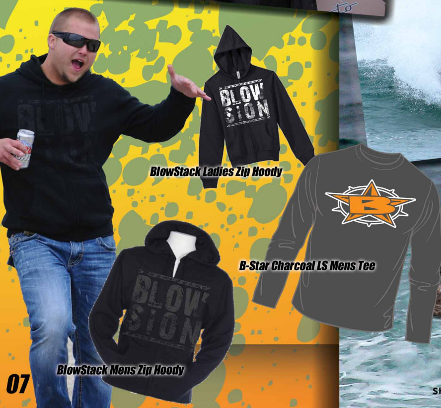
BlowStack Ladies Zip Hoody