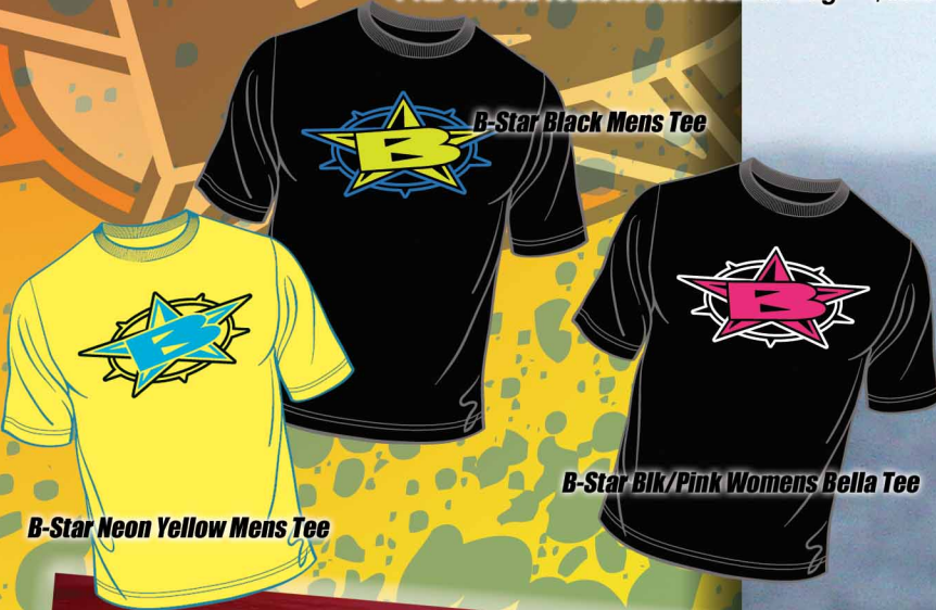
B-Star Neon Yellow Mens Tee