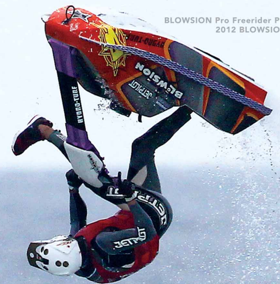
BLOWSION Pro Freerider Pierre Maixent 2012 BLOWSION SURFSLAM

BLOWSION PHONE: +1 (503) 625.3616 FAX: +1 (503) 625.1501 WEB: blowsion.com EMAIL: info@blowsion.com MAIL: PO BOX 104, SHERWOOD, OR 97140, USA SHIP: 14420 TUALATIN-SHERWOOD RD, SHERWOOD, OR 97140, USA