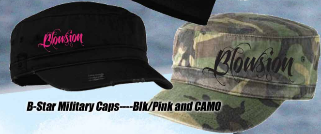
B-Star Military Caps---Blk/Pink and CAMO