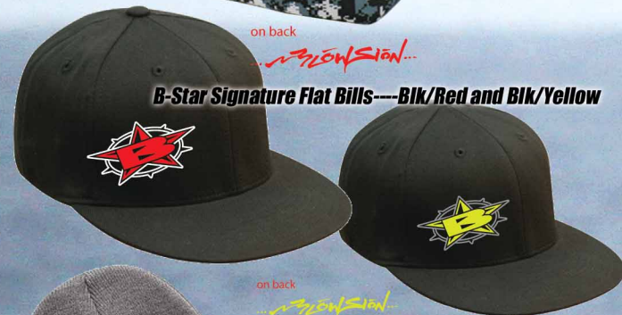
B-Star Signature Flat Bills---Blk/Red and Blk/Yellow