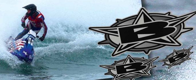
B-Star Stickers-- 3 sizes to choose from!